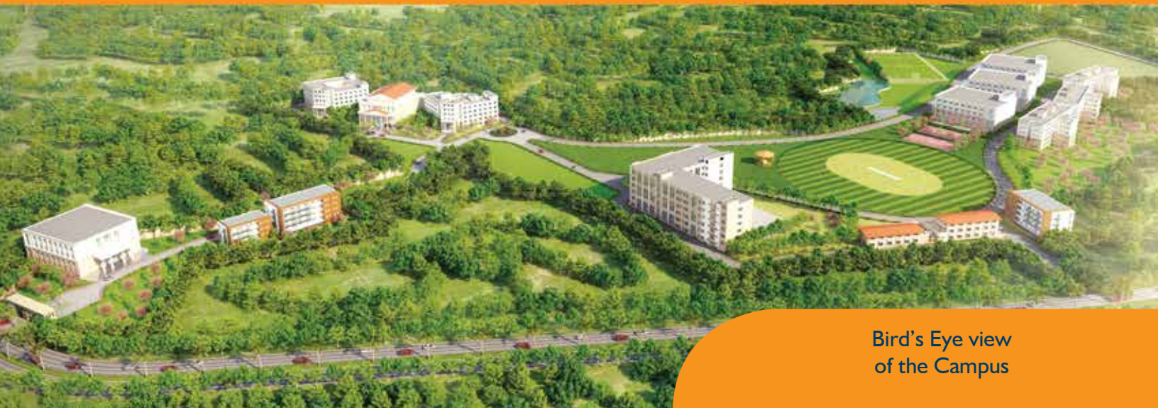
Bird's Eye view of the Campus