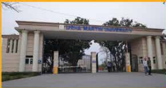
Main Entrance Gate