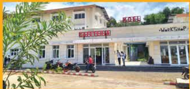
Cafeteria & Workshop